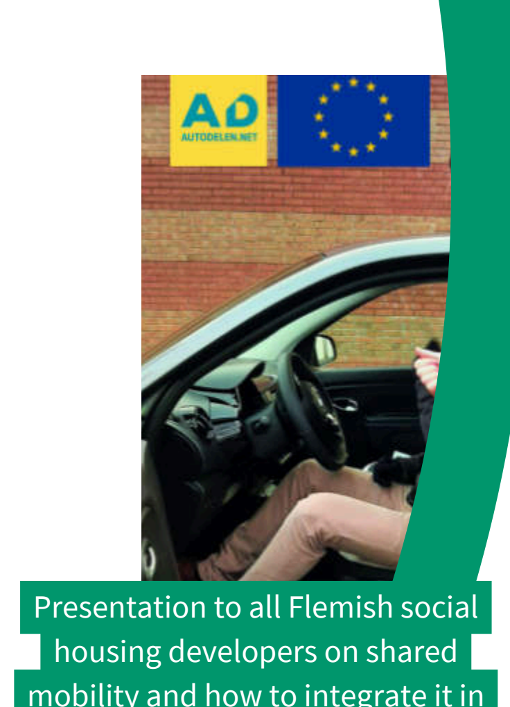
Presentation to all Flemish social housing developers on shared mobility and how to integrate it in their projects (February 2024)