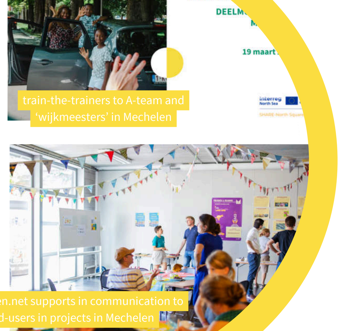
train-the-trainers to A-team and 'wijkmeesters' in Mechelen