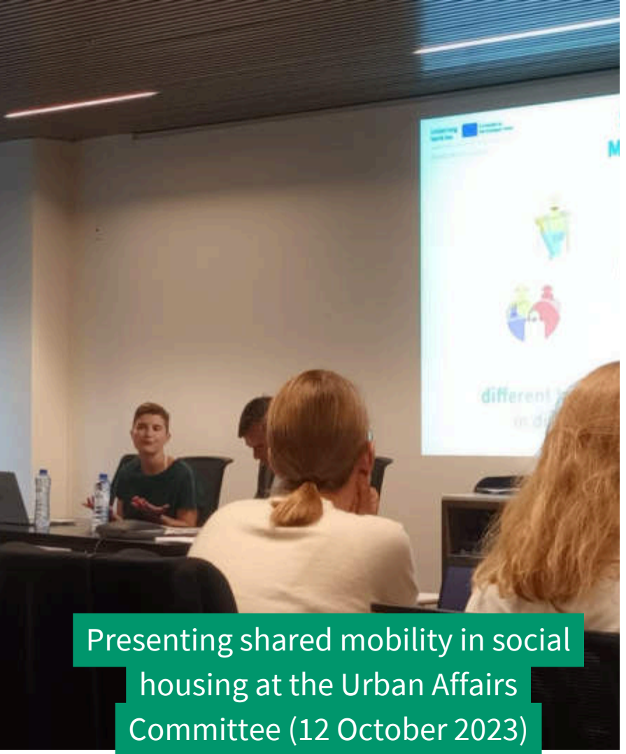
Presenting shared mobility in social housing at the Urban Affairs Committee (12 October 2023)