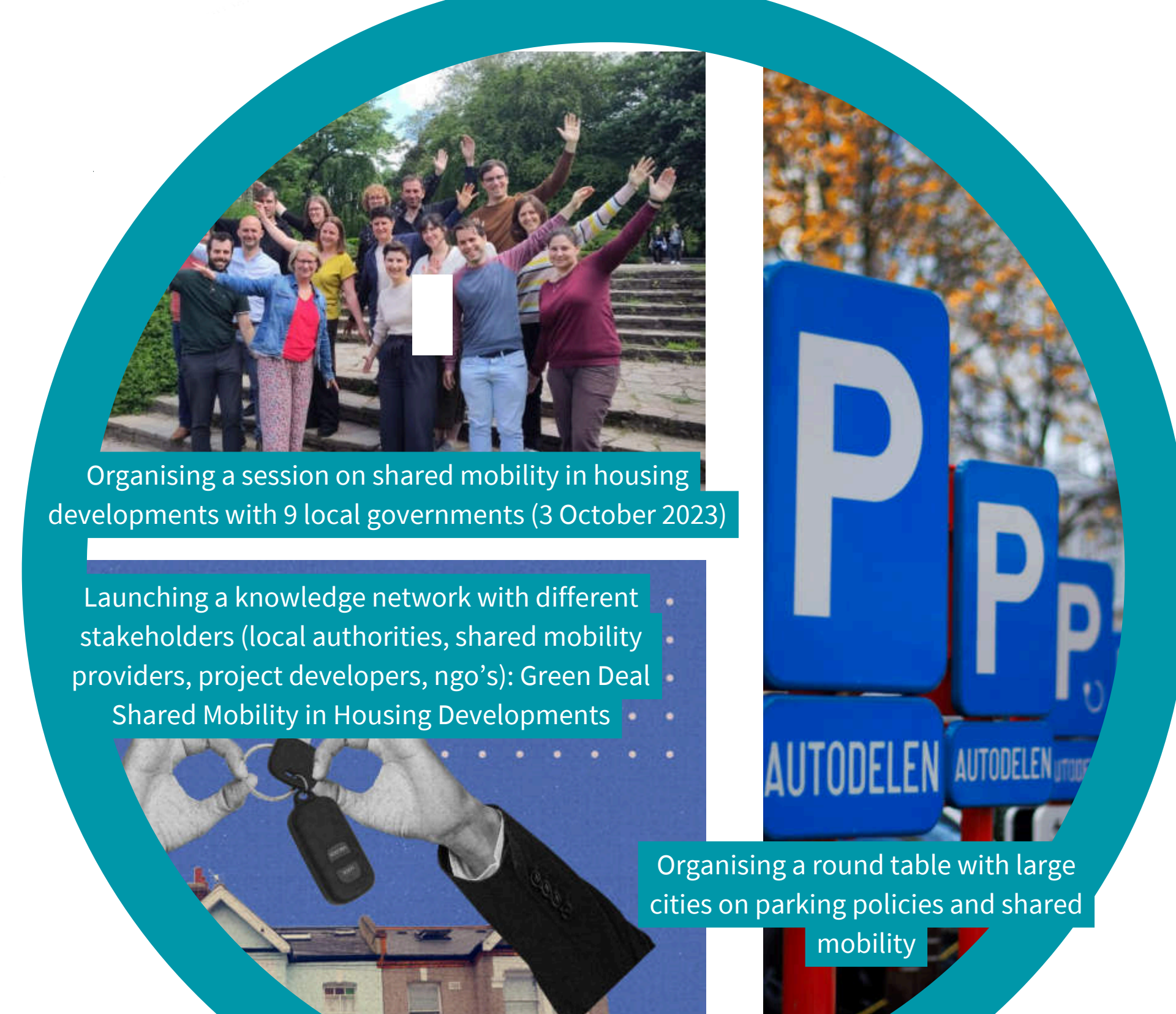
Organising a session on shared mobility in housing developments with 9 local governments (3 October 2023)