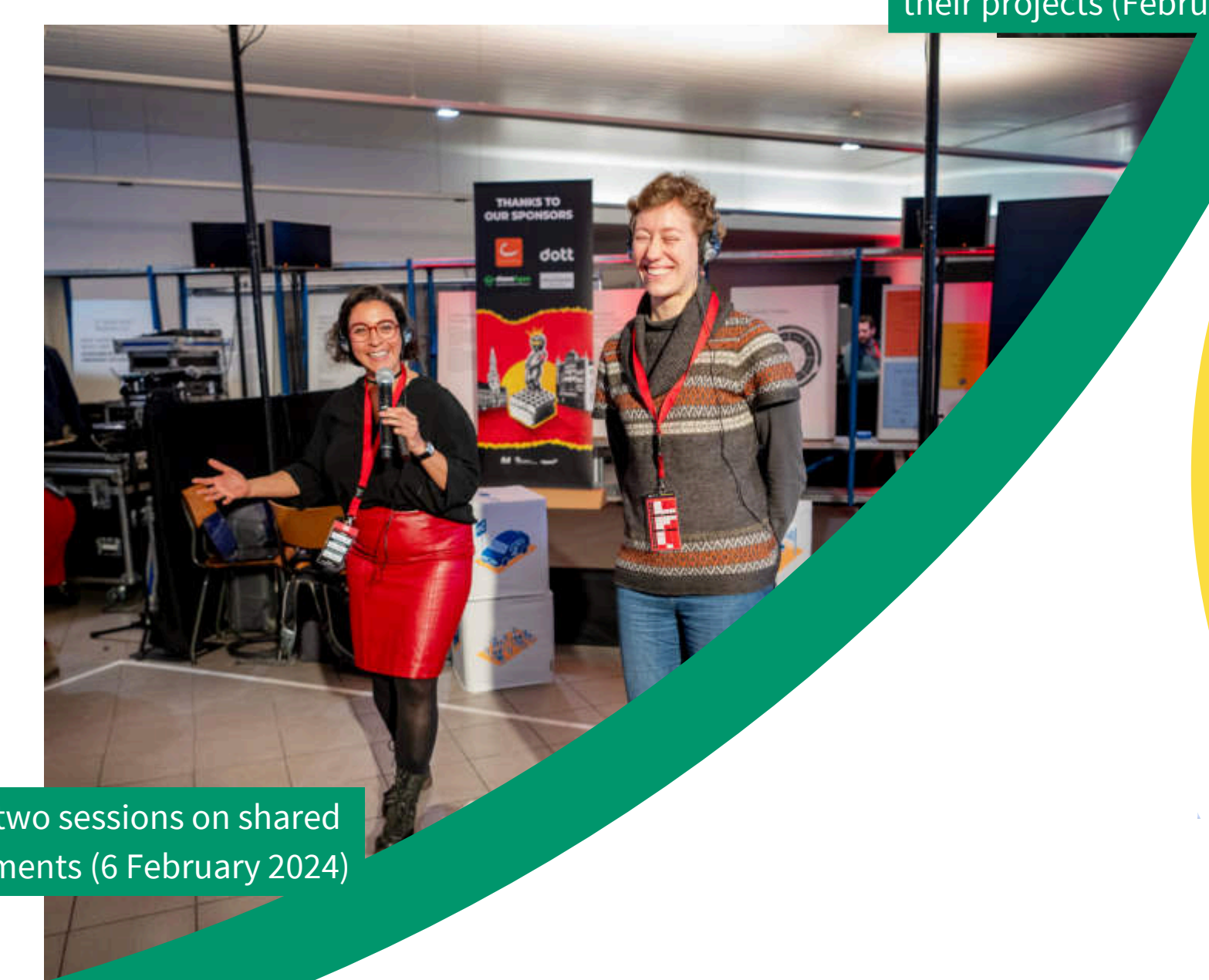
'Buurtbabbel' in the Arsenaalwijk