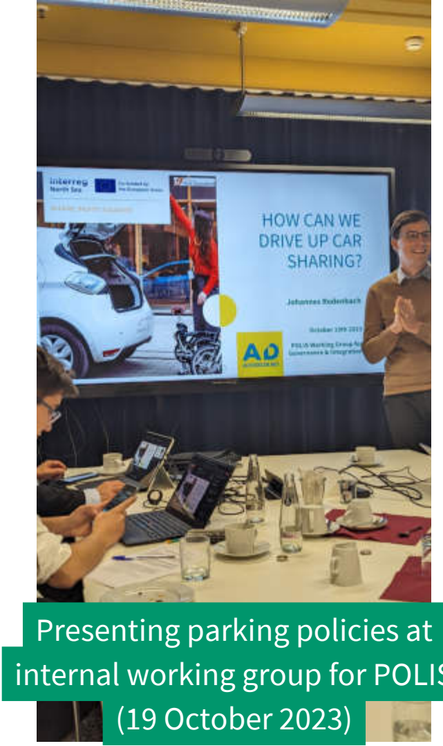
Presenting parking policies at internal working group for POLIS (19 October 2023)