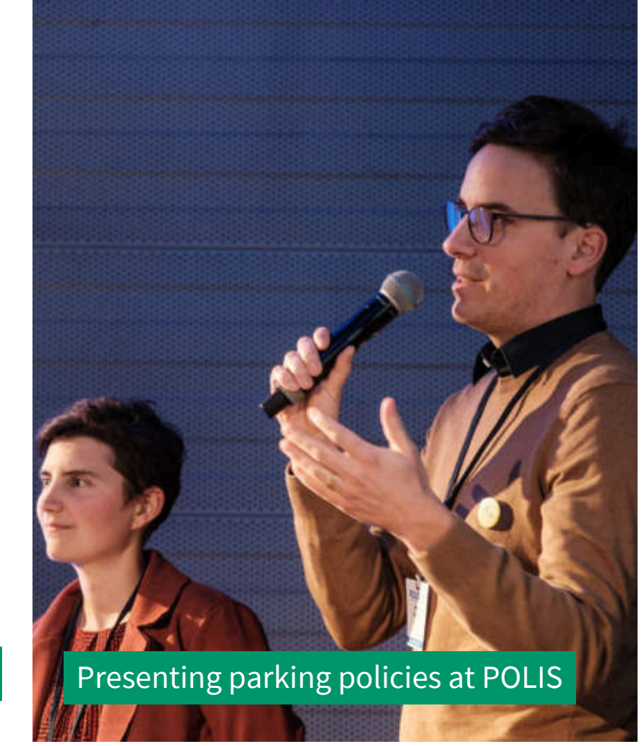
Presenting parking policies at POLIS