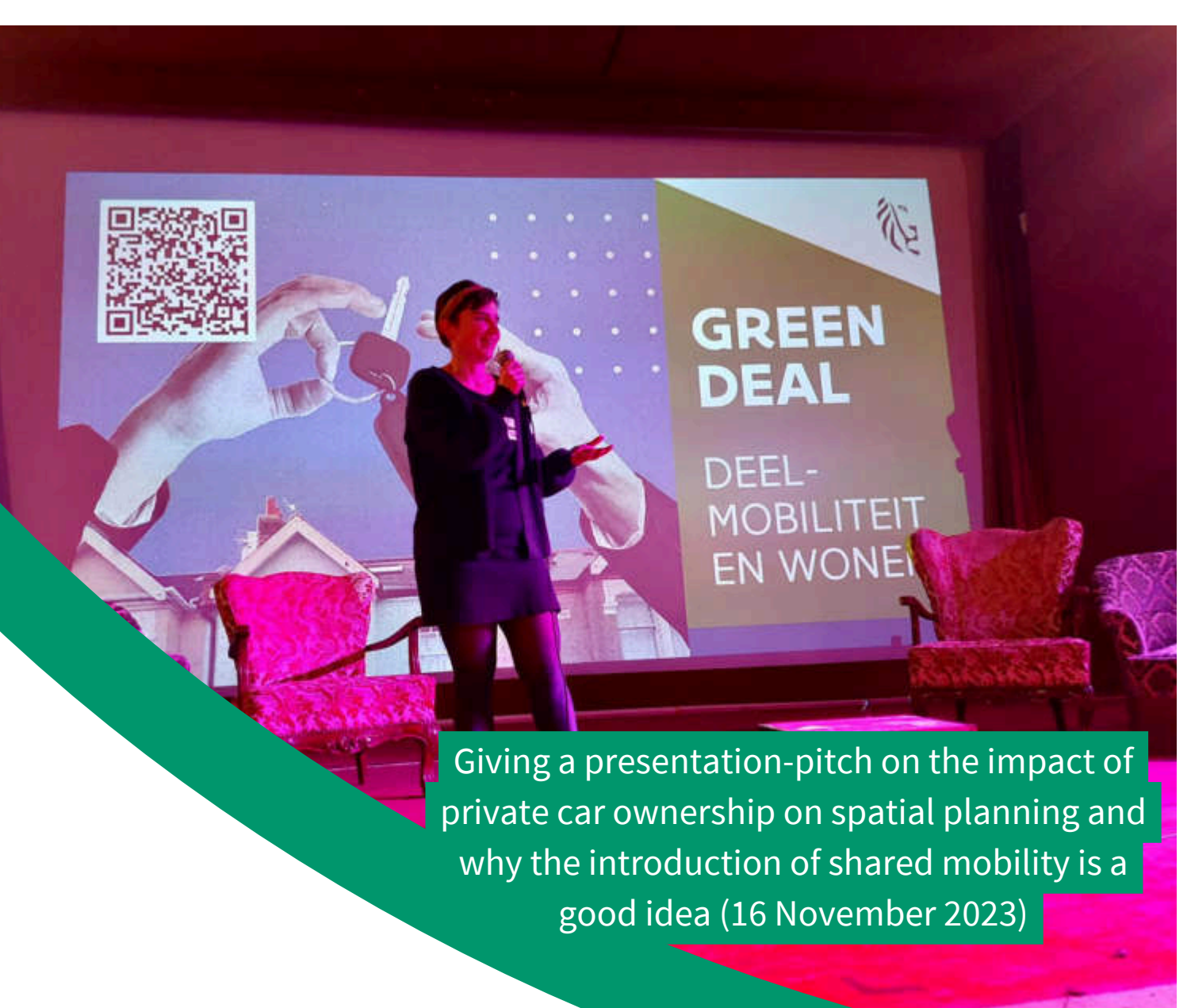
Giving a presentation-pitch on the impact of private car ownership on spatial planning and why the introduction of shared mobility is a good idea (16 November 2023)