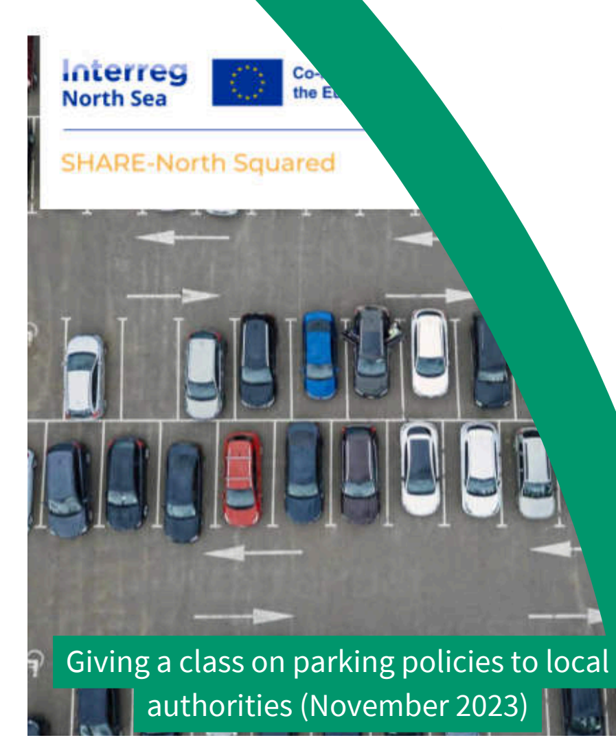
Giving a class on parking policies to local authorities (November 2023)