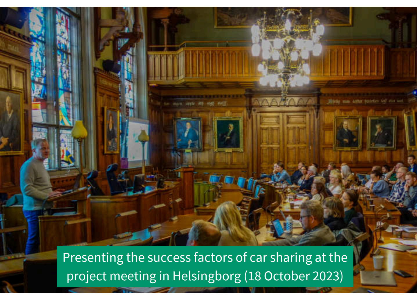
Presenting the success factors of car sharing at the project meeting in Helsingborg (18 October 2023)