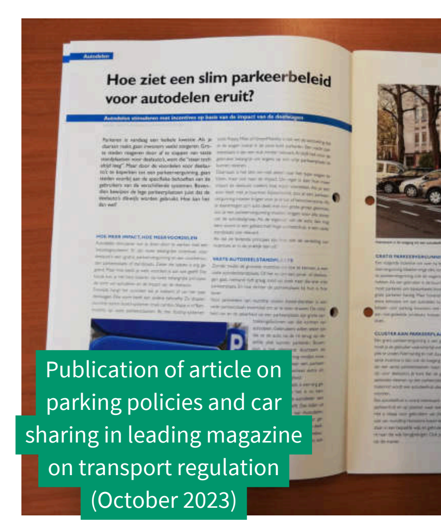
Publication of article on parking policies and car sharing in leading magazine on transport regulation (October 2023)