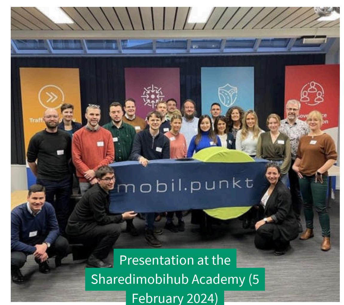
Presentation at the Sharedimobihub Academy (5 February 2024)